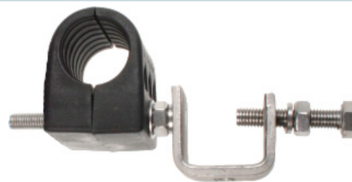
picture shows MBHS78-1-F for illustration purpose