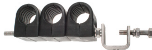
picture shows MBHS78-3-F for illustration purpose